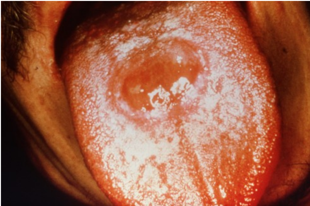
Primary syphilis sore (chancre) on tongue