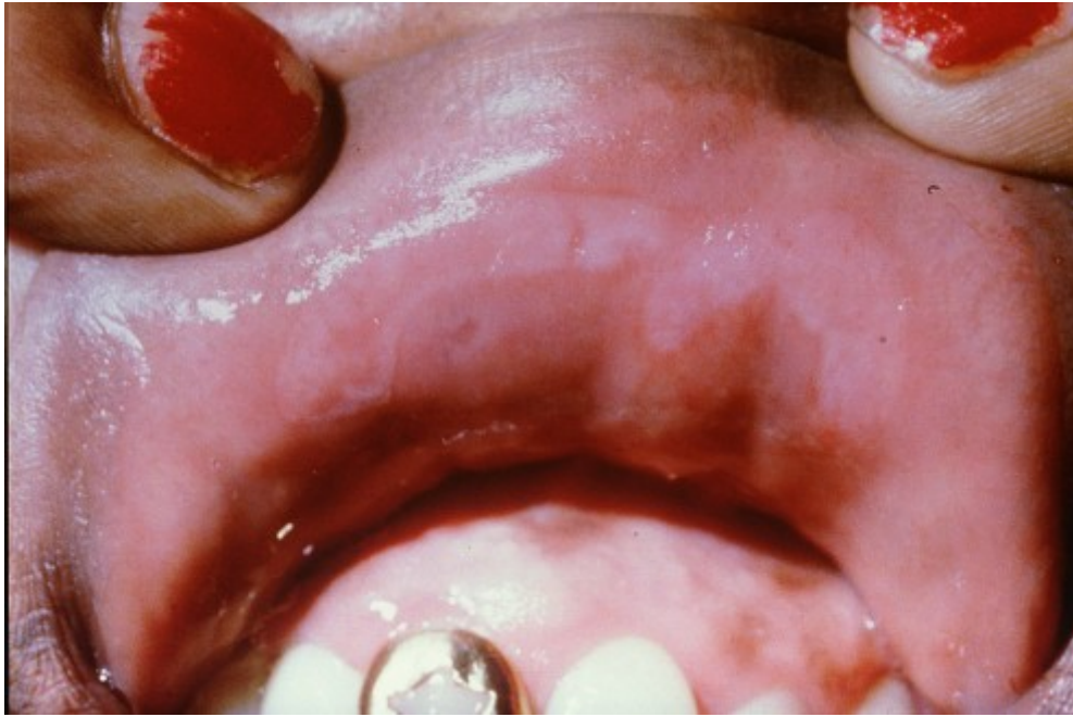
Primary syphilis sore on upper lip