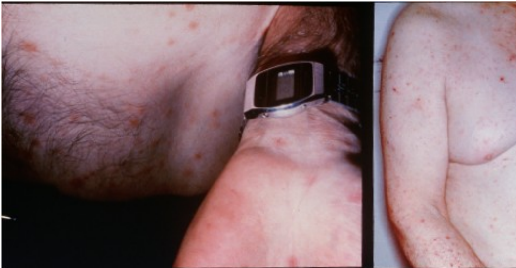
Secondary syphilis rash