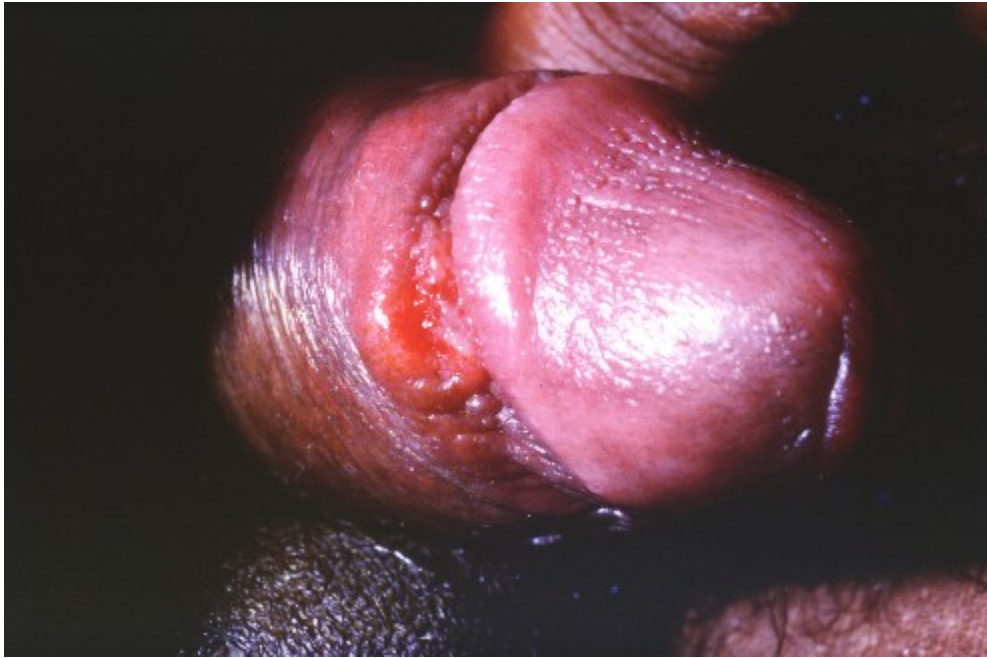
Primary syphilis sore (chancre) on penis